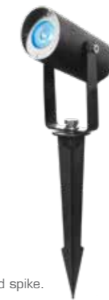
Shown with removable ground spike.