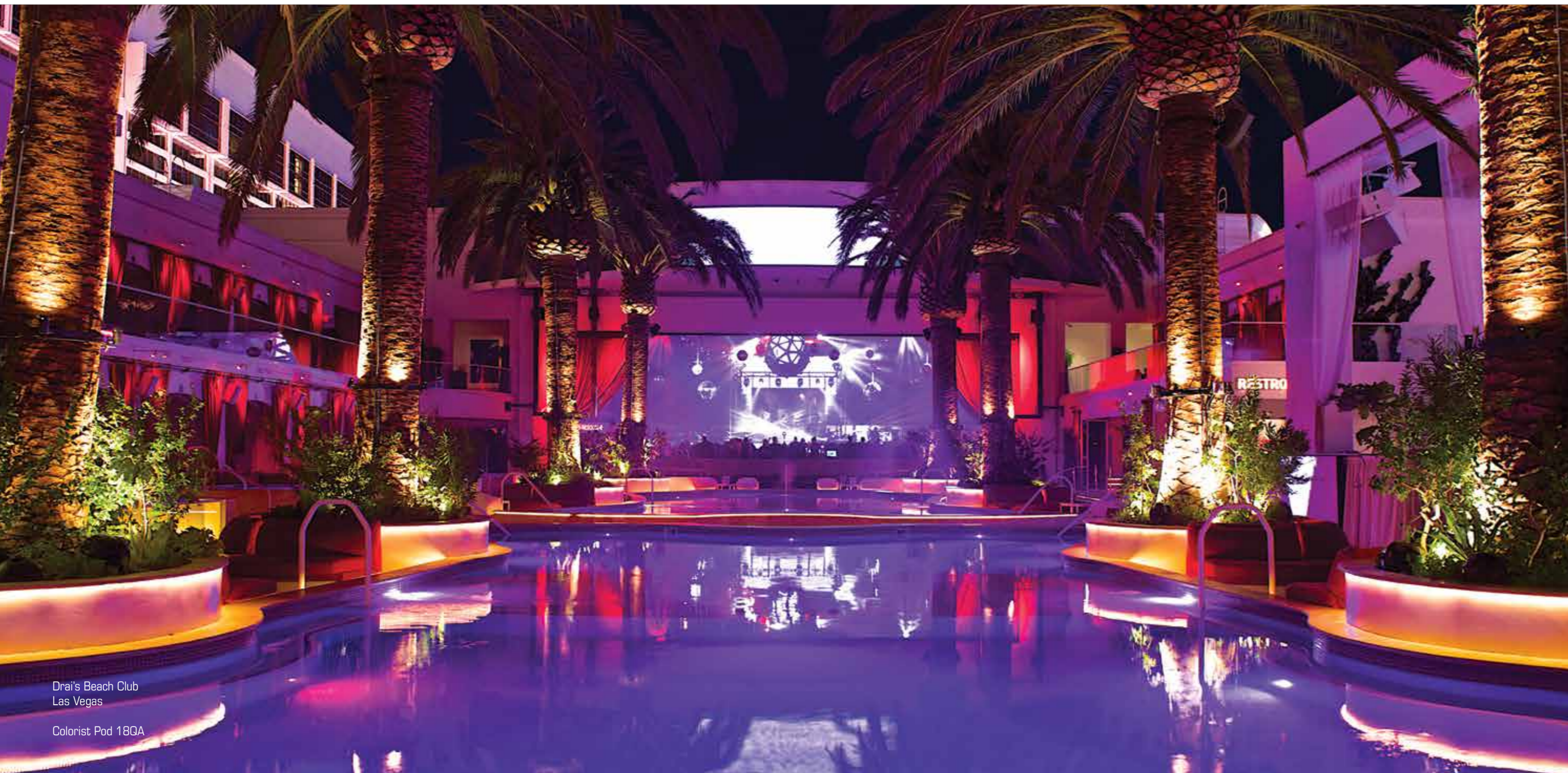
Drai's Beach Club Las Vegas